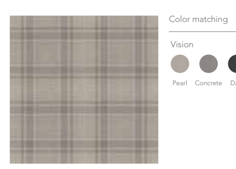
Soul Tartan Cold 24"x24"