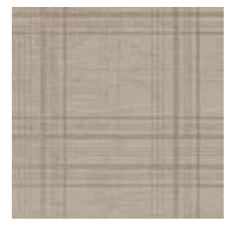
Soul Tartan Delicate