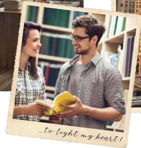
...to light my heart!