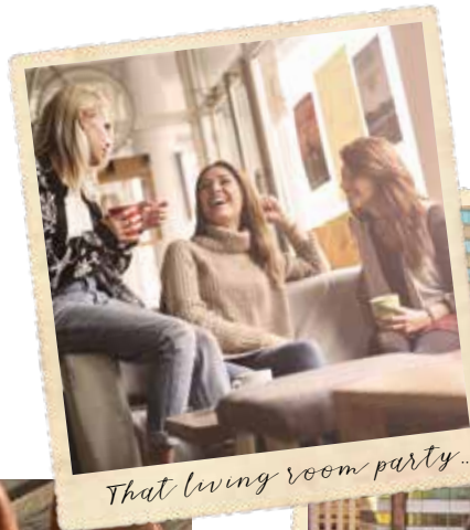
That living room party...