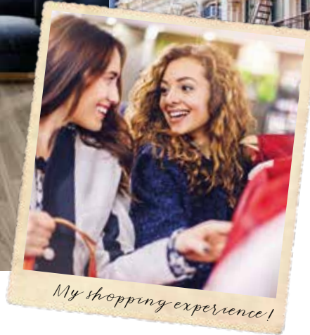
My shopping experience!